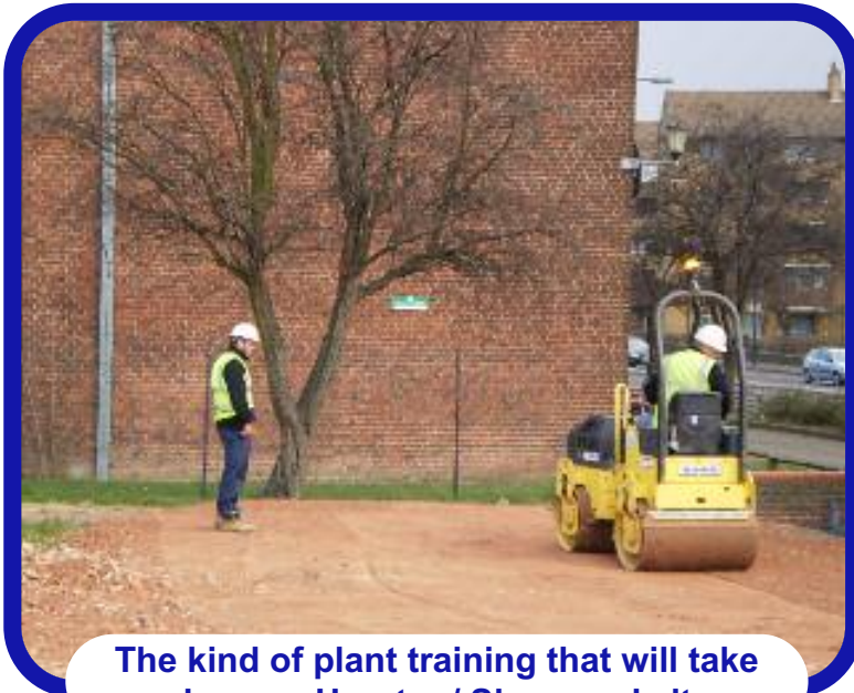
The kind of plant training that will take place on Horston/ Sherwood site

Training by clicking here: http://www.citrustraining.com/default.asp