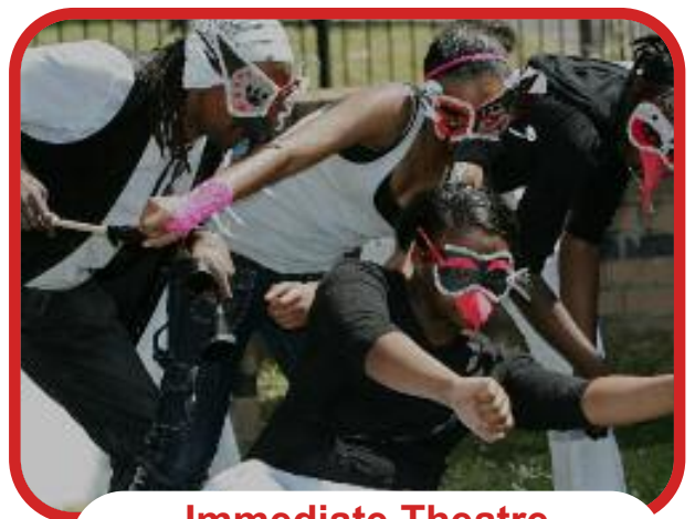
Immediate Theatre perform

Last year, Immediate Theatre received support from Arts Council England and Well London to produce a week of events at the Robin Redmond Resource Centre and Parkside Youth Club, which included a spectacular street parade led by the AfroReggae Bigga Blocco youth band. This year is set to be bigger, bolder, and even more creative with opportunities for people to get involved in arts and crafts activities, explore different cultures through dance, get fit and active and dress up the neighbourhood.