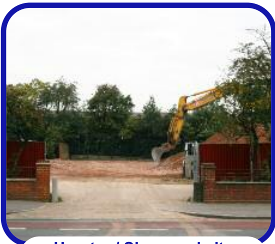
Horston/ Sherwood site today

WTP CIC will provide short accredited training courses on an empty site awaiting development. The majority of training will be for construction plant, although many other subjects such as working at height and in confined spaces will be offered. In total over 100 courses will be available on a commercial basis.