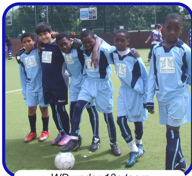
WD under 13s team

The football team has enabled the Trust to partner with a number of agencies to get involved with the project. Access to Sport has provided the training and coaching. The London Sustainability Exchange (LSX) provided resources for the young people to understand the importance of healthy eating and wellbeing and the Well London Cup has offered a tournament and fun day out for the team and their families and supporters.