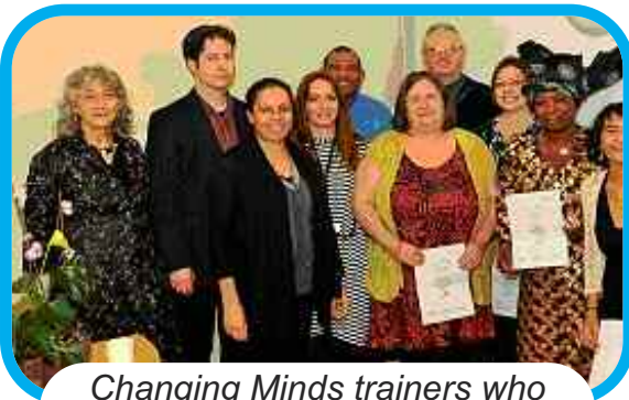
Changing Minds trainers who will be in the WD area soon