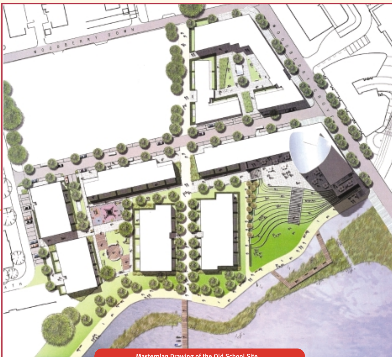
Masterplan Drawing of the Old School Site

All of the buildings will be designed to take full advantage of sunlight. Residents will have access to private amenity areas – either as balconies, terraces or private gardens (at ground level). The design also hopes to encourage life to the street through the integration of tree lined avenues with the use of long corridors and deck access being avoided. Creation of a safe environment will be provided through defensible private gardens, enclosed communal spaces and a well considered street scene of shops and community facilities.