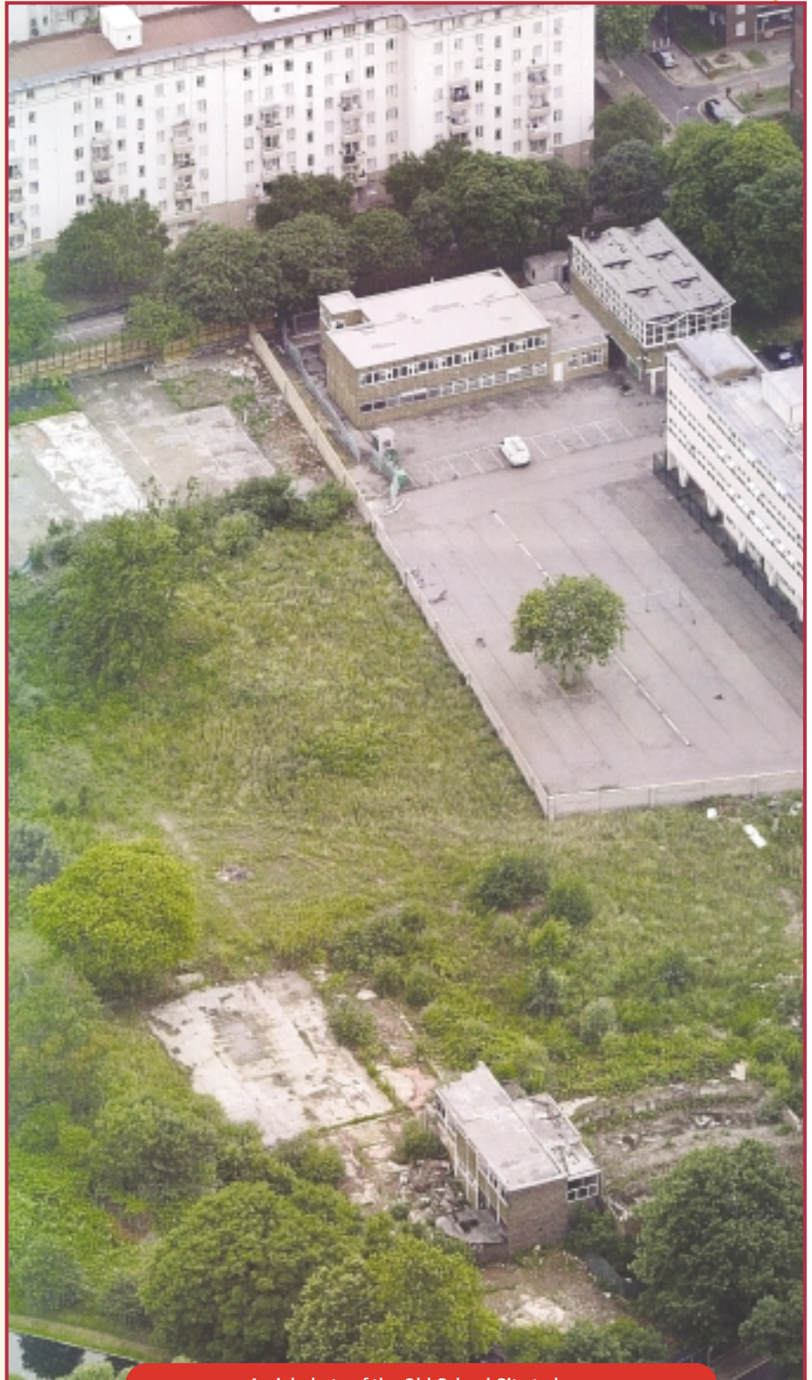
Aerial photo of the Old School Site today