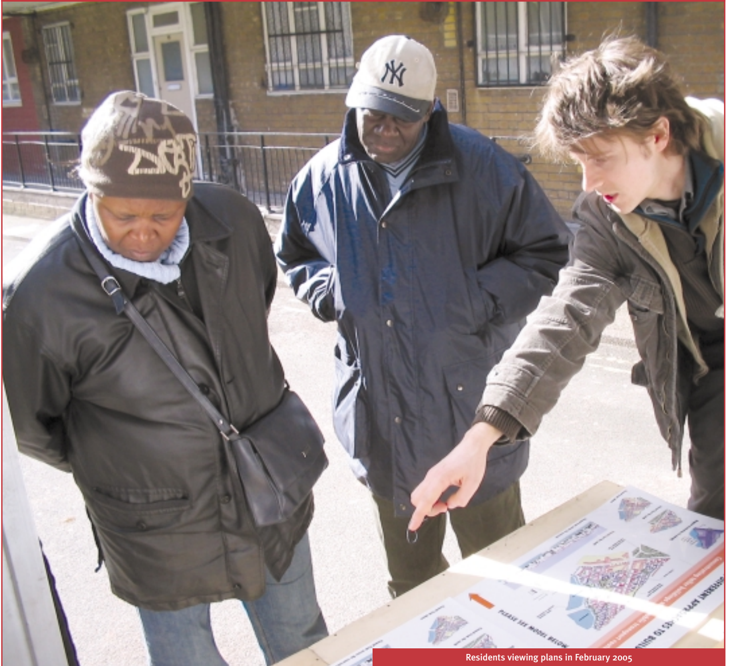
Residents viewing plans in February 2005