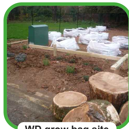
WD grow bag site