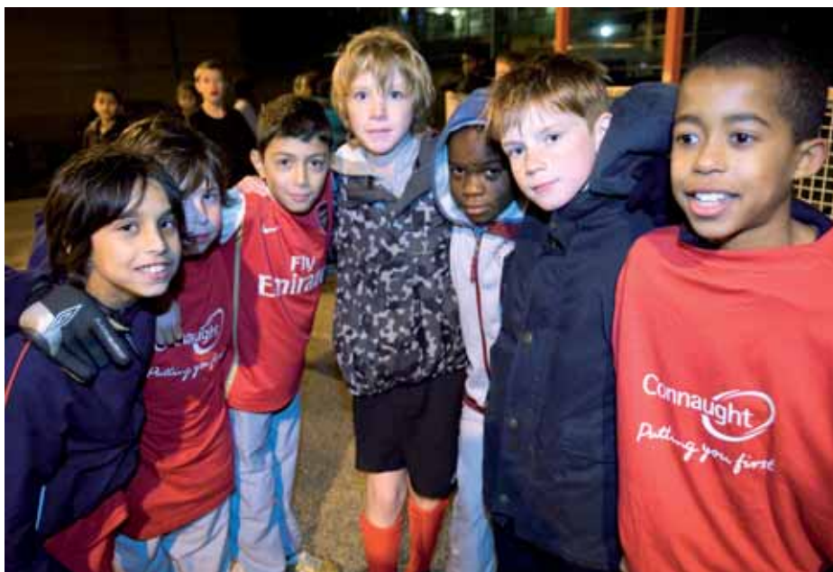
The Kickz Football Programme is one of the new initiatives introduced by Hackney Homes providing young people a chance to learn from football experts

Residents expressed an encouraging response towards Hackney Homes' communication and information initiatives with 70% of respondents feeling they have been kept well-