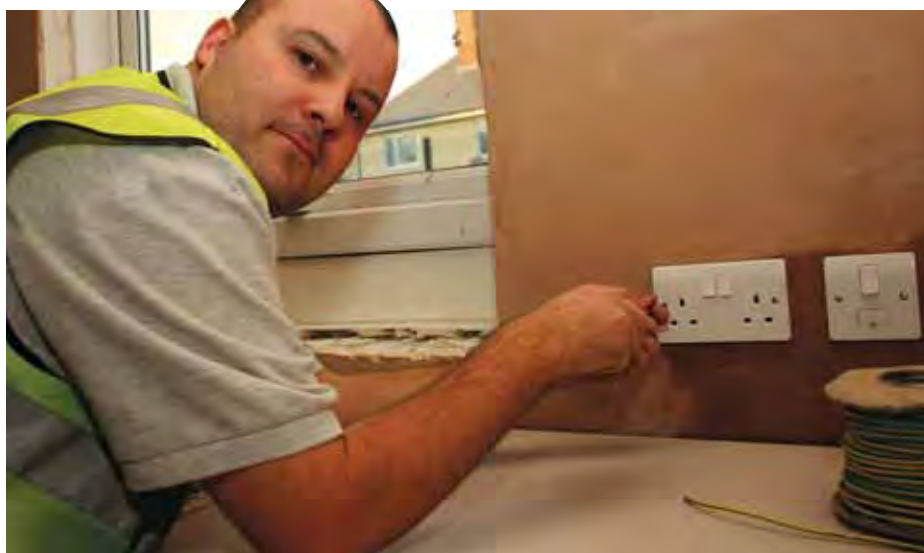
Residents are now benefiting from a wider range of repairs services