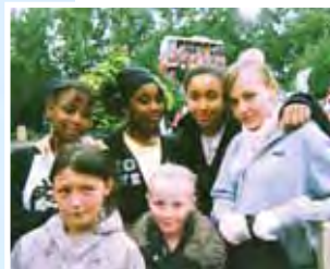
Young people from Regents Estate enjoy fun day out