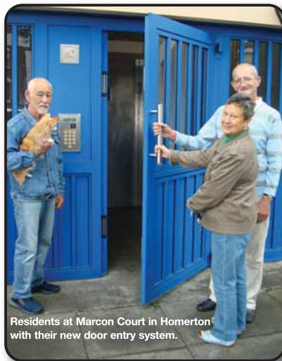
Residents at Marcon Court in Homerton with their new door entry system.

To report anti-social behaviour on your estate, contact your local Neighbourhood Office. If the matter is urgent, contact the Police on 999.