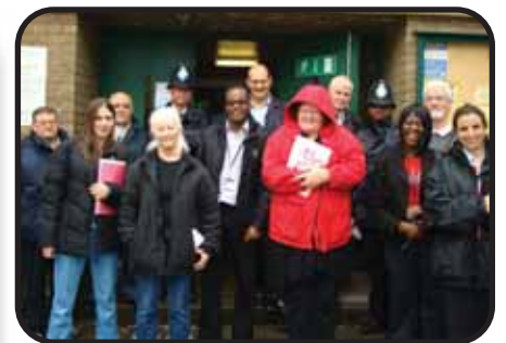
Residents, staff and police attend the Zero Tolerance on Crime forum.