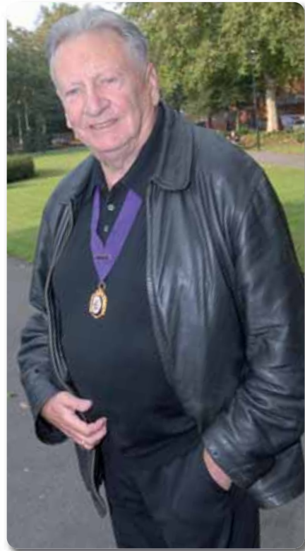
Chairman of the Regeneration Board of Stamford Hill and Woodberry Down.