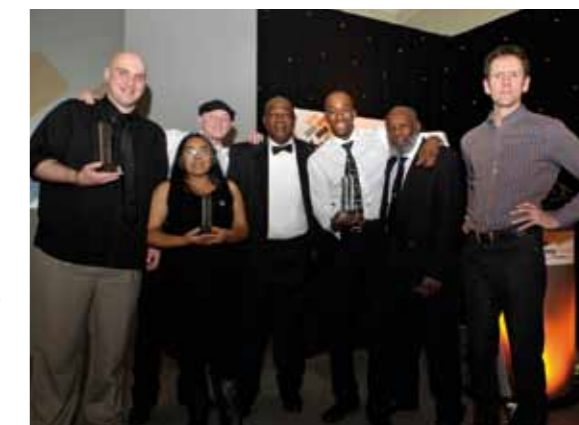
Below: Residents from Hawksley Court Estate who won Resident Group of the Year last year.

The closing date for nominations is Friday 6th November 2009.