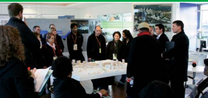
Above: Residents are shown the Royal Arsenal Masterplan model

Over 75% of residents who attended felt better-informed as a result of the visit, and many appreciated the opportunity to see both empty and occupied properties in the two Berkeley developments.