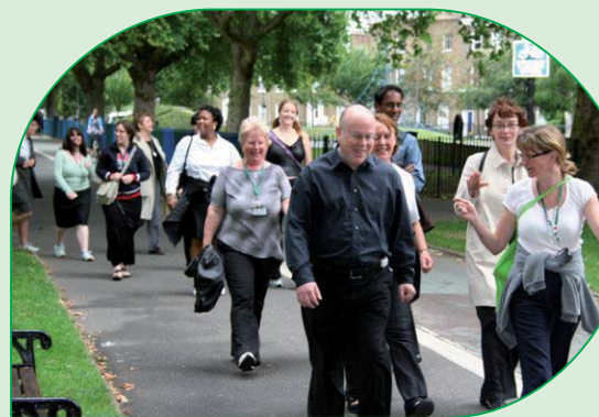
Right: Healthy walks in the park