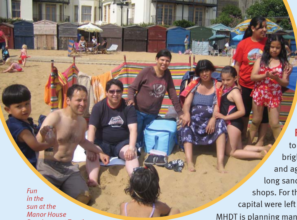
Fun in the sun at the Manor House Development Trust's Seaside Day Out programme to BURA members

'Can We Go Again' was the overwhelming feedback from those attending the Manor House Development Trust first annual sea-side trip.