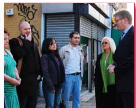
Getting the community involved