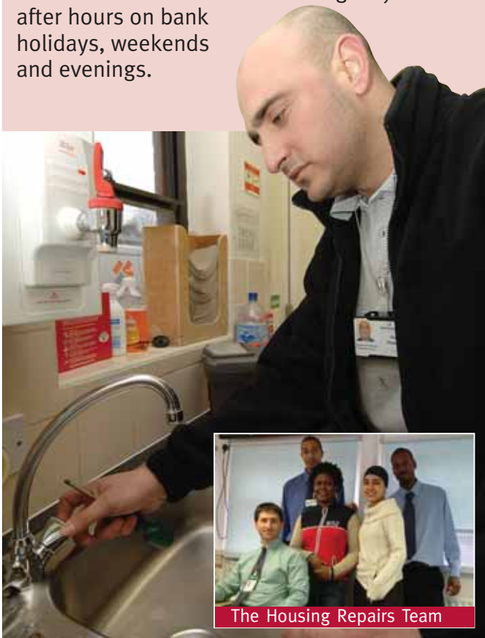
The Housing Repairs Team

Over the Christmas period tenants can phone the call-centre number 0208 356 3691 which will divert to the Homecare Emergency Service after hours on bank holidays, weekends and evenings.