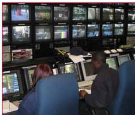
Stoke Newington CCTV Centre