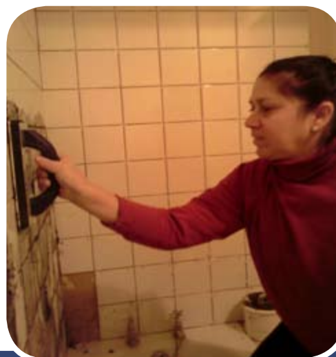
Right: Woodberry Works trainees learning tiling.