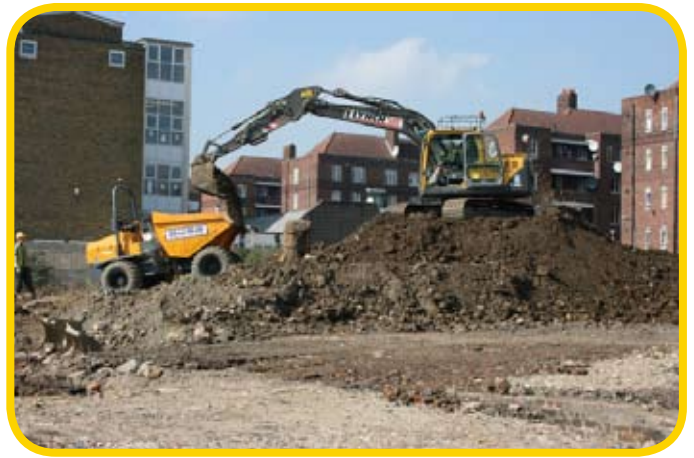
March 09 Preparation work begins on site