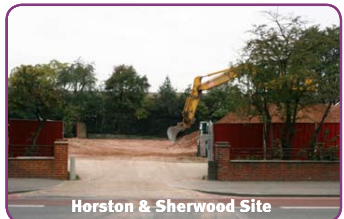
Horston & Sherwood Site