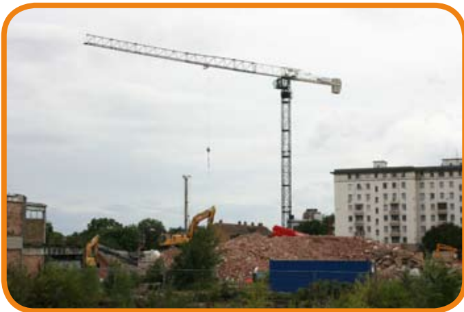
July 09 The Tower Crane is erected