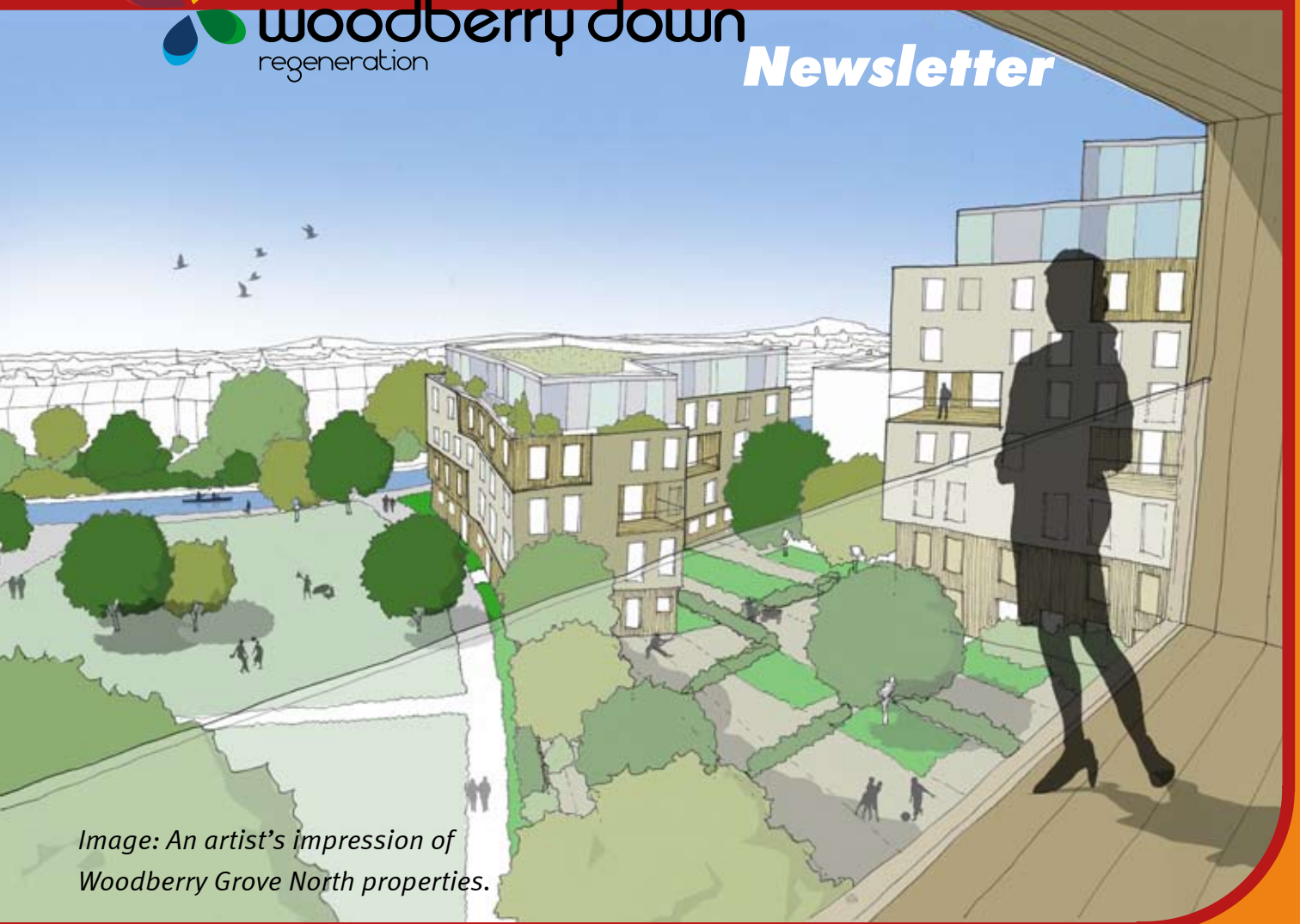
Image: An artist's impression of Woodberry Grove North properties.