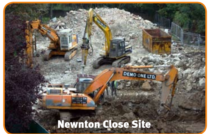
Newton Close Site

Demolition completed October 2009 5-23 and 25-55 Newton Close 1-35 Sherwood House 1-30 Horston House