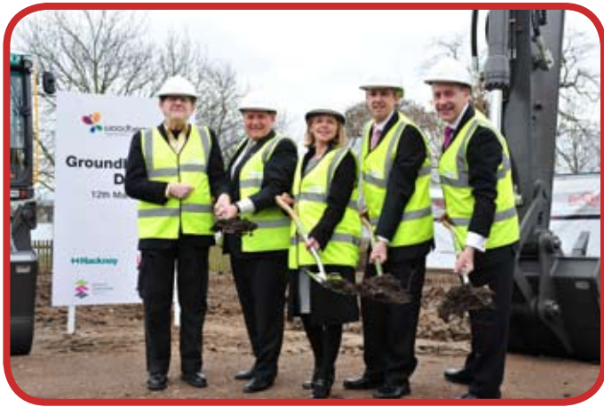
12 March 09 Groundbreaking Day marking the start of construction