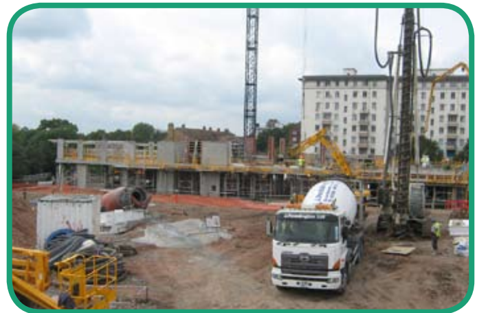
August 09 Block F reaches 1st floor level