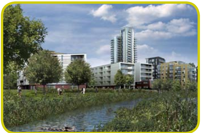
View of how Block F and the surrounding area will likely look when finished