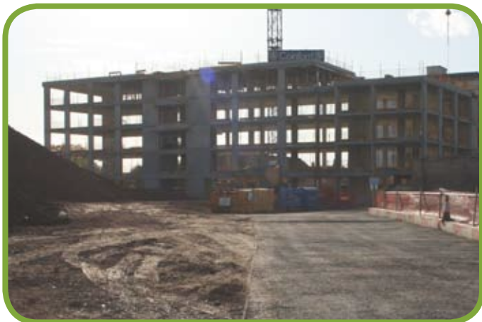
October 09 Block F reaches 4th floor level