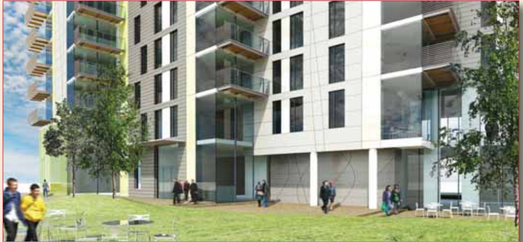
Architects impression of new Community Centre

The Woodberry Down Regeneration Team, Berkeley Homes and the Manor House Development Trust have been working together to develop the plans for the new Woodberry Down Community Centre to be located on the Old School site