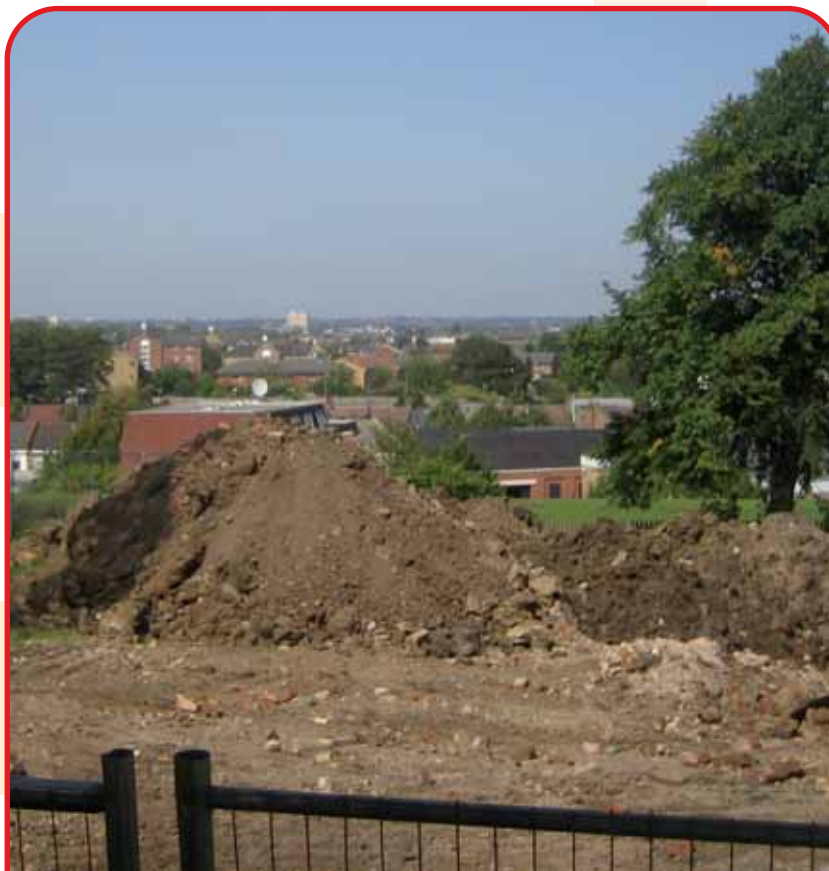
New view that can be seen at the Bewdley House site

Look out for future issues of the Woodberry Down Regeneration News as there will be a detailed plan of the development programme, showing what blocks will be demolished in what order.