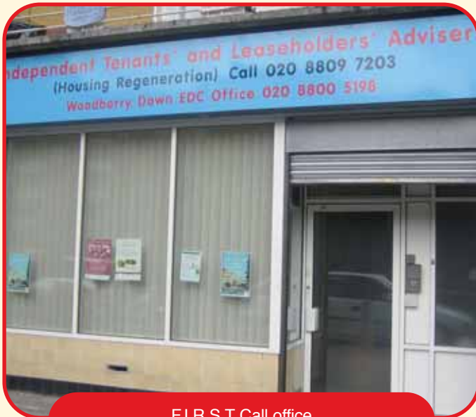
F.I.R.S.T Call office

F.I.R.S.T Call was selected by members of the EDC (Estate Development Committee) to provide independent information and advice for individual tenants, leaseholders and the EDC on the regeneration and proposed transfer of Woodberry Down to a registered Housing Association.